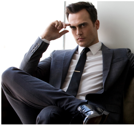
Cheyenne Jackson — September 26