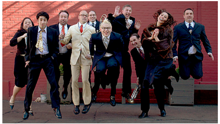
Pink Martini — March 12