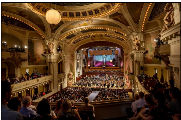
The world premiere of the violin concerto in Prague, Czech Republic