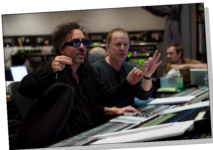
Danny Elfman working with longtime creative collaborator and director, Tim Burton, on Alice in Wonderland (2010).