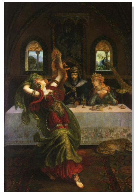
Dance of Salome . Armand Point, 1898

The music for the dance itself is designed to sound flirty, exciting, and slightly menacing, just like the character of Salome herself. While listening to this piece, imagine what the dance could possibly look like.